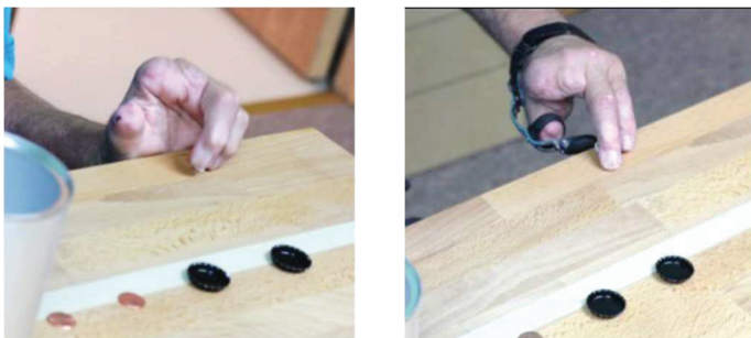
Figure 2: Lifting paperclip during JHFT