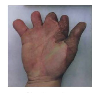
Figure 1(b): Right Hand