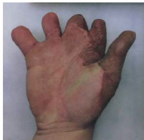
Figure 1(b): Right Hand