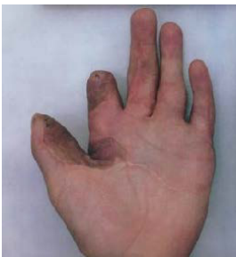
Figure 1(a): Left Hand

His residual digits allowed him to hold objects, but without a firm grip. He was able to lift a hammer, but unable to swing or control it. The loss of fingers on his right hand also greatly diminished his ability to perform the fine motor tasks required in his work.